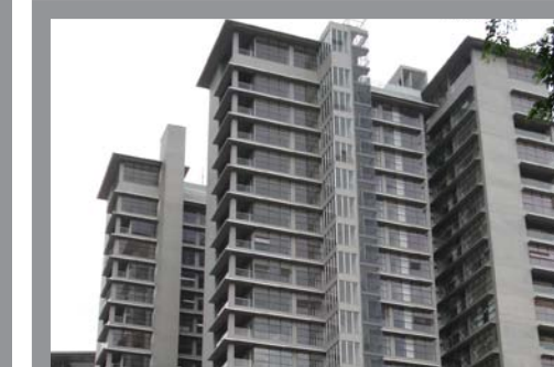
Park Seven Condominium - Malaysia