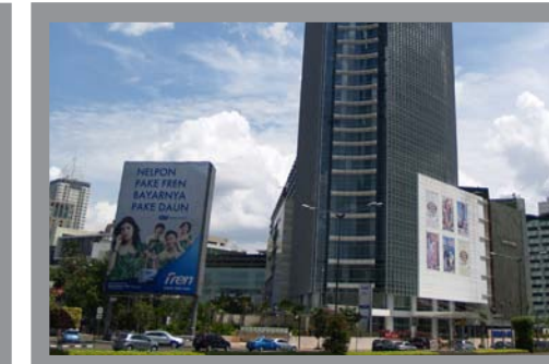
Grand Indonesia - Jakarta Indonesia