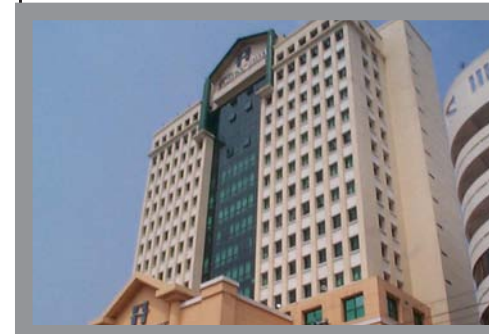
Fortuna Hotel - Hanoi, Vietnam