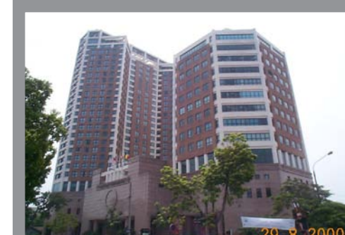
Hanoi Tower - Hanoi Vietnam