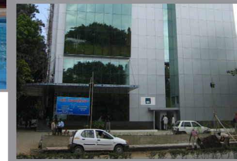
AXA Building - Pune, India