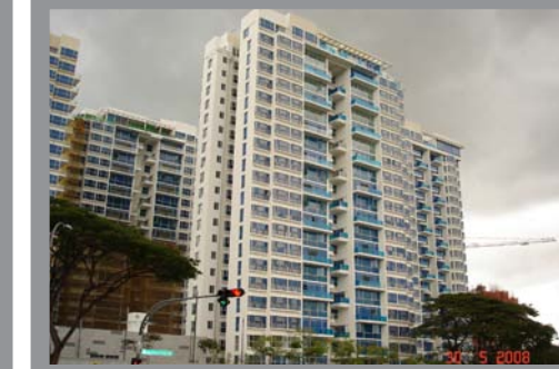
The Esta - Singapore