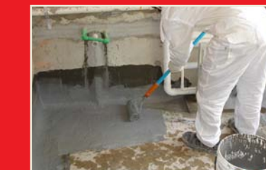
4. Membrane applied to concrete