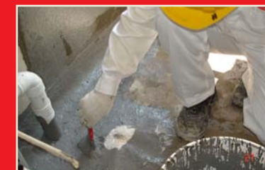
2. Membrane is applied