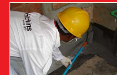
3. Termination at 300mm height