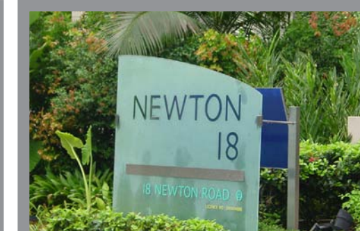
Newton 18 Condo - Singapore