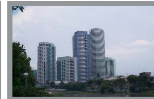
Rockwell Center - Manila, Philippines