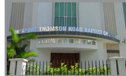
THOMSON BAPTIST CHURCH - SINGAPORE

Formdex Uni is a heavy duty waterproofing membrane that seals water, rain, ground water and masonry, concrete, plaster and similar substrates. In addition, its high build nature enables it to absorb shock transmitted through the topping material and allow some flexing between it and the substrate. Should be used as a concealed system.