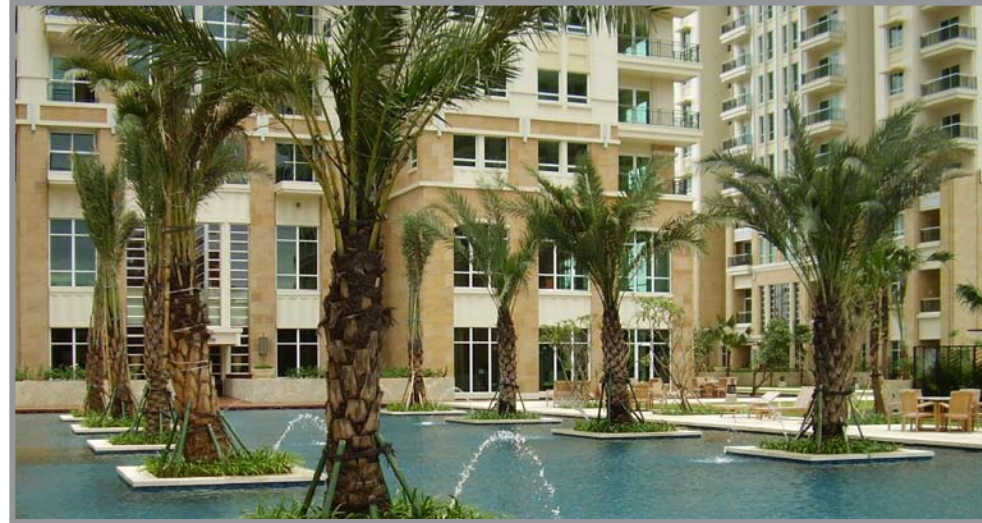
PAKUBOWONO CONDO - JAKARTA INDONESIA

Component B (liquid form) is the polymeric binder, which is essentially a modified styrene acrylic co-polymer that gives the product its excellent resistance against water and alkali.