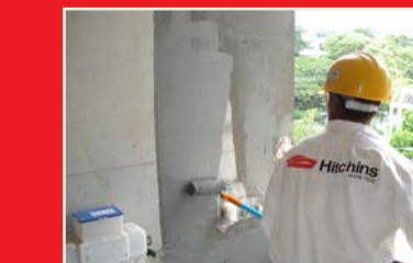
6. Membrane applied to 1.8m height