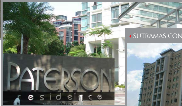
◀ SUTRAMAS CONDO - KL, MALAYSIA