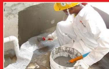
1. Reinforced with fibreglass