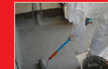
5. Membrane applied in 2 coats